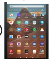
10" Amazon Fire Tablet